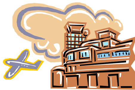
American Dreams, and Americans Change

have done some of the worst things in history. They treated African Americans with no respect, no communication between whites and African Americans and segregation which means the practice of keeping ethnic separated especially by enforcing the use of separate schools, transportation, housing and other facilities. In today's time we have changed a great deal. There in no segregation now and communication skills have increased, and African Americans are treated with respect. We have some of the most wonderful persons in upper offices. For starters we had Martin Luther