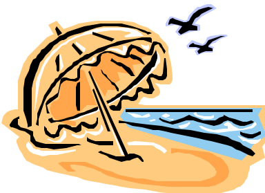
HAPPY DAY'S ARE HERE AGAIN!!!!

Happy days are here again! In a month or two, it will be Spring. Time to get out and do new activities once more. After so long with cabin fever we can enjoy the freedom of wide open spaces,