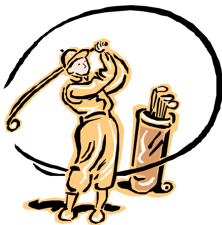
Affirmations can break or make you

It is a good idea to use affirmations in your everyday life. It can help you though your problems. Don't put yourself down or talk bad to yourself. Why do people put