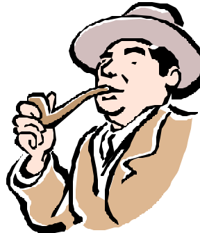
Returning members and new faces are among us again.

It is good to be back at the recovery center. I will do my best to take one day at a time and do my best to come on se-